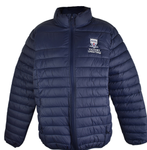
Puffer Jacket (Foundation to Year 12)