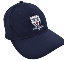
Cap (Year 7 to Year 12) Terms 2 & 3 only