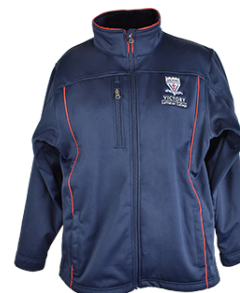
Soft Shell Jacket (From Size 8)