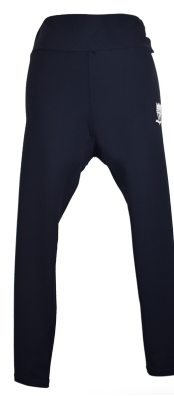
Girls Sport Leggings (Year 7 to Year 12)