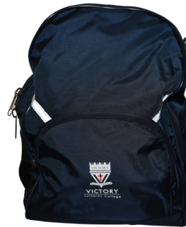
Primary "Uno" (Foundation to Year 6)

The school bag is compulsory for all new students. From 2025, all students will be required to have a College school bag.