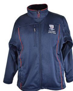
Soft Shell Jacket (From Size 8)