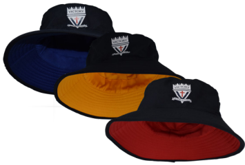
Reversible (House Colour) Bucket Hat (Worn All Year) (Foundation to Year 12)