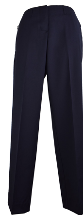
Custom-fit Slacks (Foundation to Year 12)