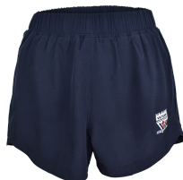
Girls Sports Short with brief (From Size 8)