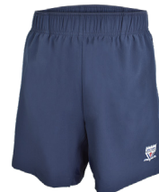
Sports Short (Foundation to Year 12)