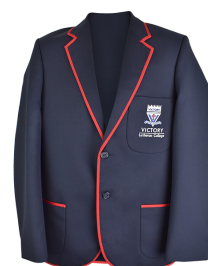
Blazer (Year 10 to Year 12)

The Tie is to be worn with a shirt as part of the formal uniform and is not required with the dress.