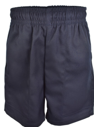
Custom-fit Shorts Elastic Waist (Foundation to Year 6)