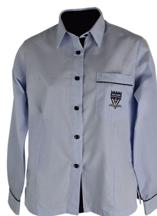
Long sleeve Shirt (Foundation to Year 12)