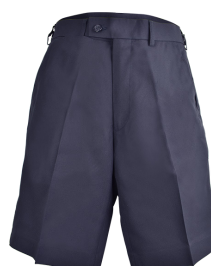
Classic-fit Shorts (Year 5 to Year 12)