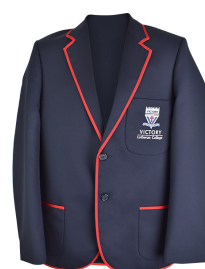
Blazer (Year 10 to Year 12)

The Tie is to be worn with a shirt as part of the formal uniform and is not required with the dress.