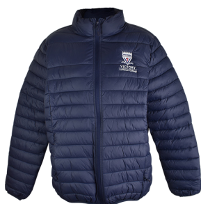
Puffer Jacket (Foundation to Year 12)