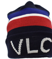
Beanie (Foundation to Year 12)