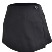
Skort (Foundation to Year 6)