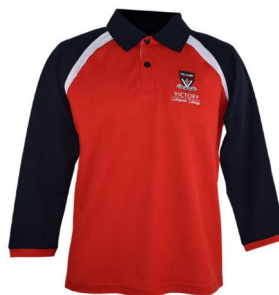
Long Sleeve Polo (Foundation to Year 12)