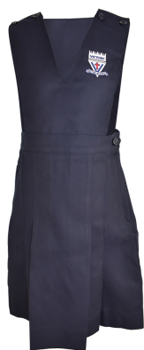
Pinafore (Up to Size 14)