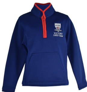
1/4 zip Windcheater (Foundation to Year 6)