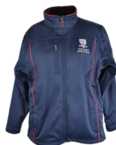
Soft Shell Jacket (From Size 8)