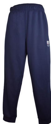
Tracksuit pant (From Size 12)