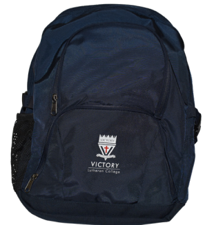
Secondary "Aero" (From Year 5 to Year 12)