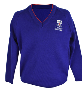
Pullover Jumper (Year 7 to Year 12)