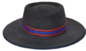
Formal Hat (Year 7 to Year 12) Optional