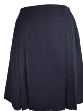
Skirt (From Size 8)