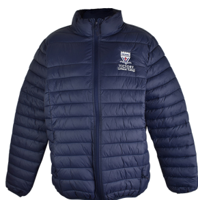
Puffer Jacket (Foundation to Year 12)