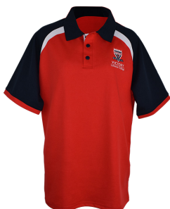
Short Sleeve Polo (Foundation to Year 12)

The Sport uniform is only to be worn on allocated sport days or at sporting events unless instructed otherwise by a teacher.