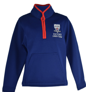
1/4 zip Windcheater (Foundation to Year 6)