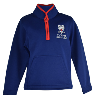
1/4 zip Windcheater (Foundation to Year 6)