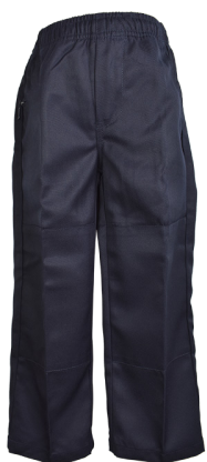
Classic-fit Trousers (Foundation to Year 6)