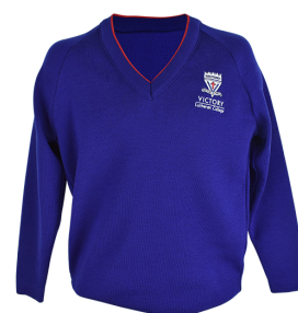
Pullover Jumper (Year 7 to Year 12)