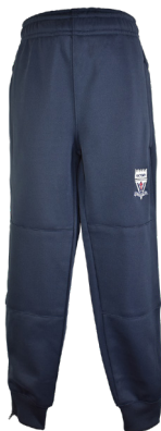
Double-knee Tracksuit pant (Up to Size 12)