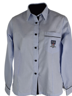
Long sleeve Shirt (Foundation to Year 12)