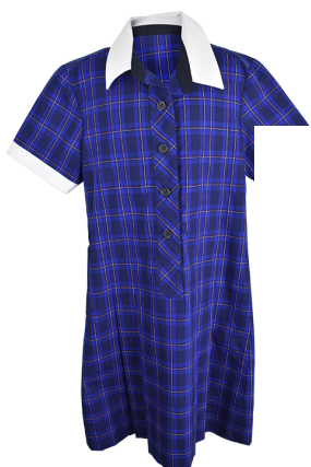
Dress (Foundation to Year 12)