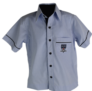
Short sleeve Shirt (Foundation to Year 12)