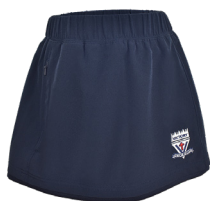
Girls Sports Skort (Foundation to Year 6)