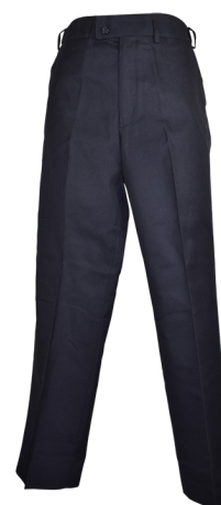
Classic-fit Trousers (Year 5 to Year 12)