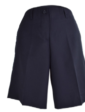
Custom-fit Shorts (Foundation to Year 12)