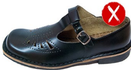
Year 2 to Year 6