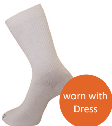
Socks White 2 pkt