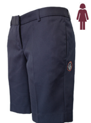
Shorts Tailored (girls)