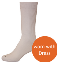
Socks White 2 pkt