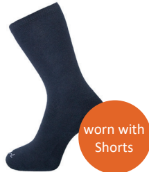
Socks Navy 3 pkt