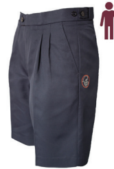
Shorts Pleated (boys)