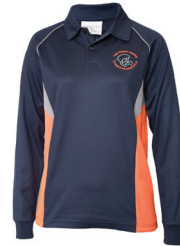
Polo Long Sleeve