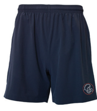
Sport Short Unisex Stretch Microfibre