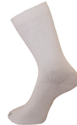
Socks White 2 pkt