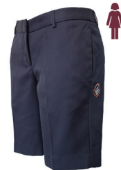
Shorts Tailored (girls)