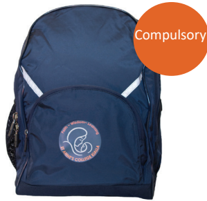
Uno Pack - Foundation to Year 6