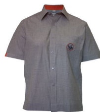
Shirt Short Sleeve