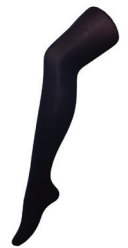
Navy cotton tights