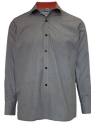
Shirt Long Sleeve