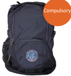
Aero Pack - Year 7 to 12