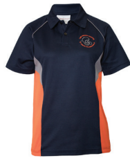
Polo Short Sleeve