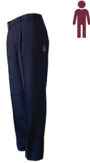
Trousers Pleated (boys)