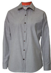
Blouse Long Sleeve