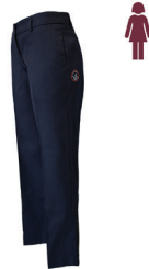
Pants Tailored (girls)