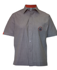
Shirt Short Sleeve