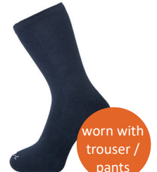
Socks Navy 3 Pkt